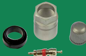
609-116 Valve Core Kit