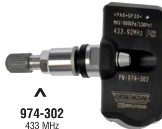
▲ 974-302 433 MHz MULTI-FIT Sensor