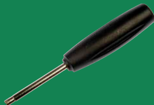
974-500 Valve Core Torque Tool Torque Spec: 4Nm