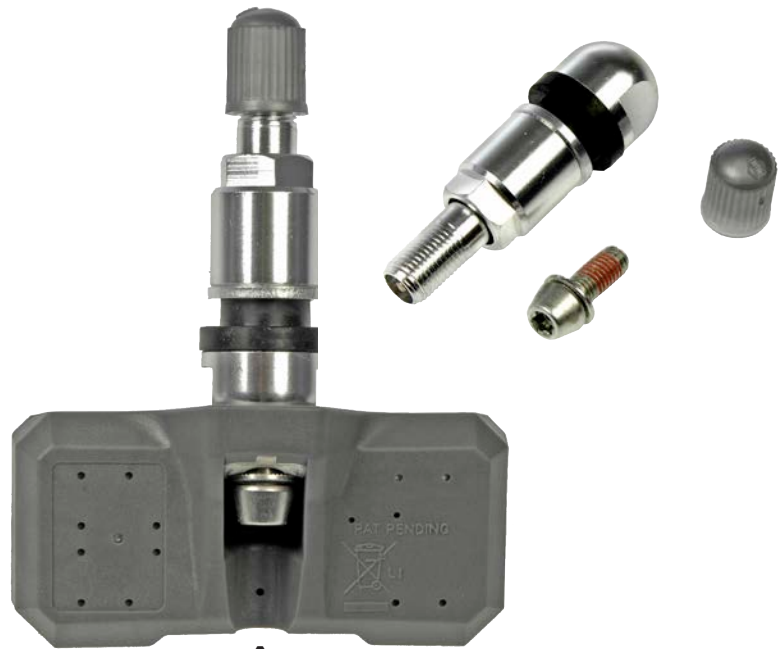
974-001 Chrysler, Jeep 2012-05

DiRECT-FIT features an adjustable two-piece design ensuring proper fit in OE and Aftermarket rims.