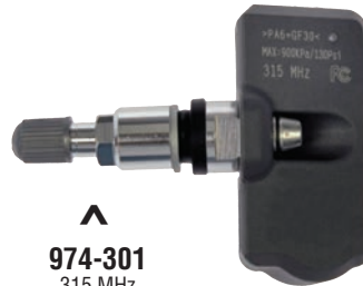
▲ 974-301 315 MHz MULTI-FIT Sensor