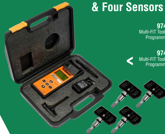
974-515 Multi-FIT Tool + Four 315 MHz Programmable Sensors