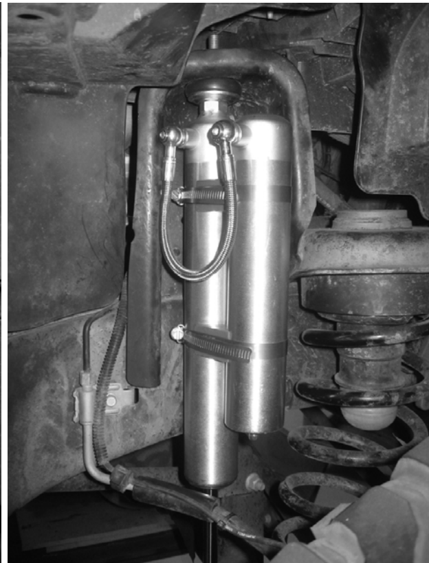
Figure 2. front passenger side