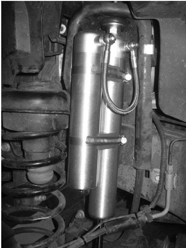
Figure 1. front driver side