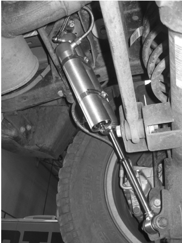
Figure 3. rear driver side