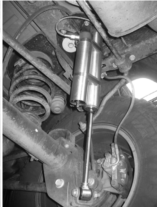
Figure 4. rear passenger side