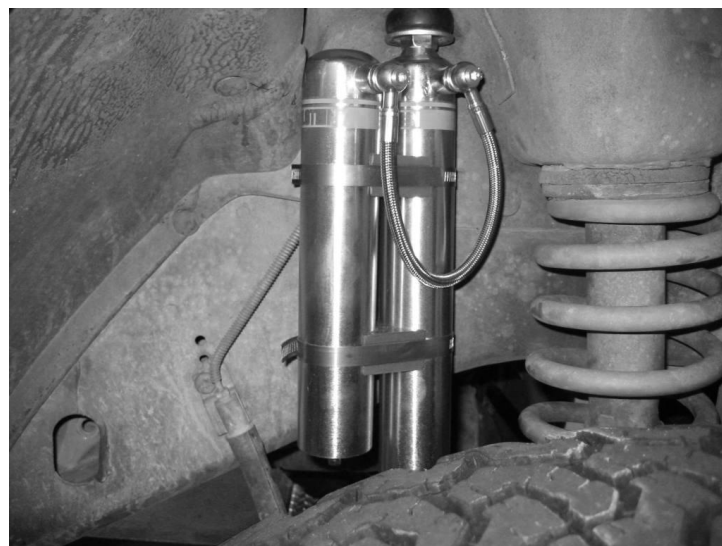
Figure 2. front passenger side