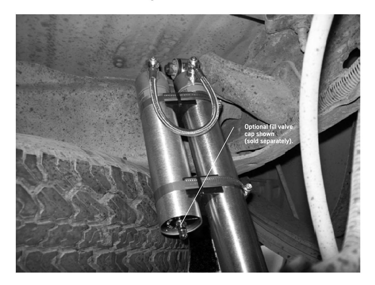
Figure 1. rear driver side