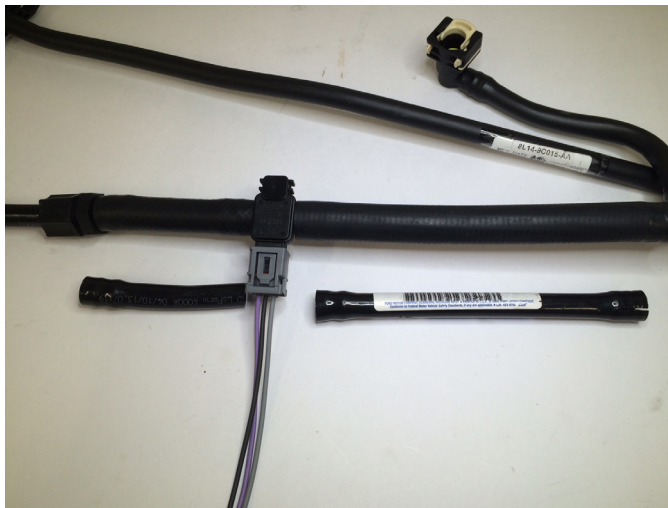
Completed repair example

STEP 11: Reconnect battery and test drive.