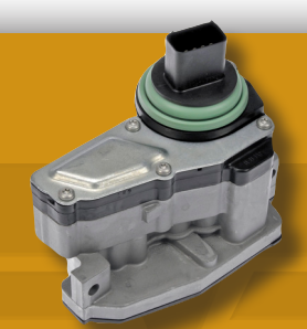
609-041 Dodge Durango 2005-04, Jeep Liberty 2005-03, Jeep Wrangler 2005-03