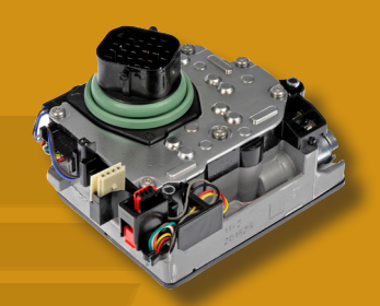
609-043 Chrysler 2015-07, Dodge 2015-08, Ram 2015-14