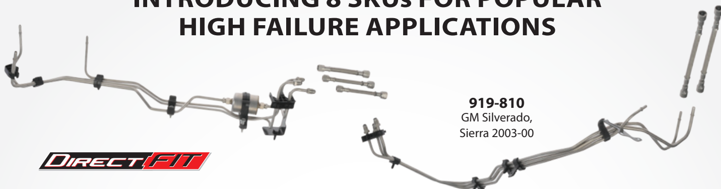
919-810 GM Silverado, Sierra 2003-00