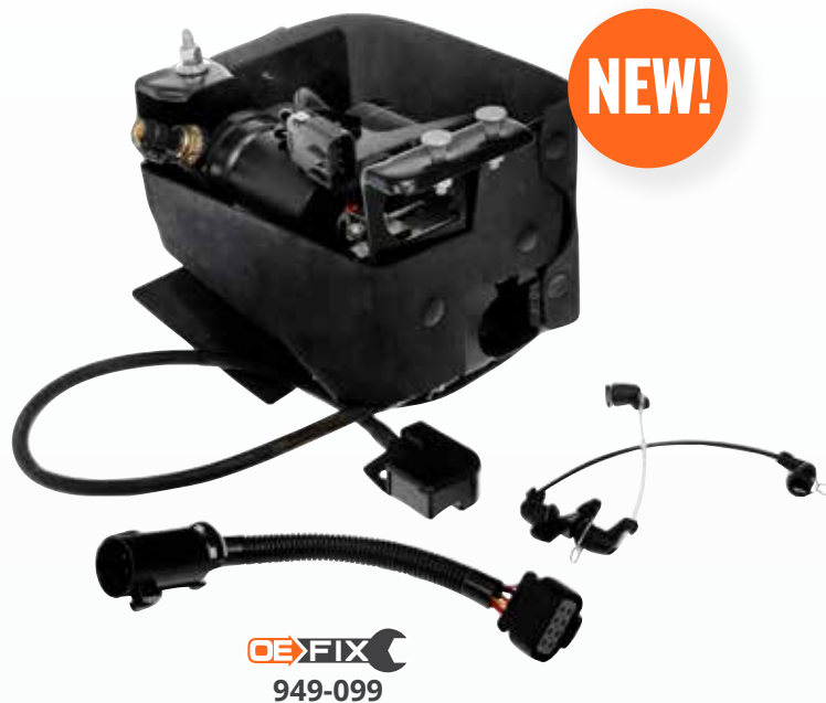
Cadillac 2014-02, Chevrolet, GMC 2014-01